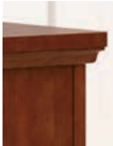
Mitered Rim Profile