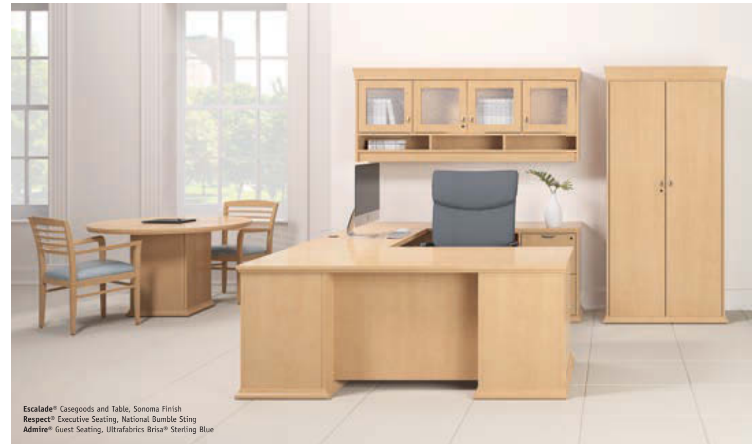
Escalade® Caseloads and Table, Sonoma Finish Respect® Executive Seating, National Bumble Sting Admire® Guest Seating, Ultrafabrics Brisa® Sterling Blue