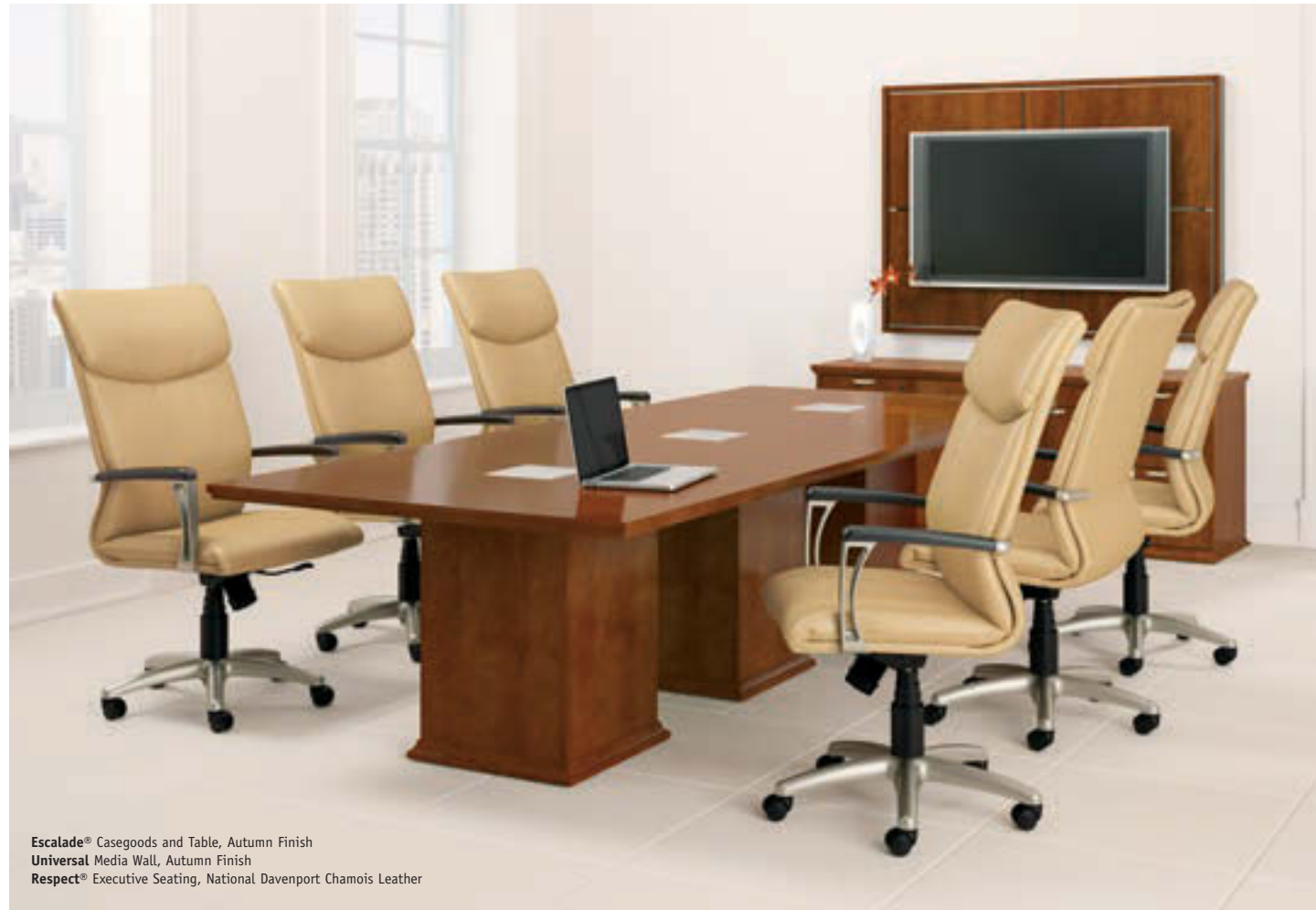
Escalade® Caseloads and Table, Autumn Finish Universal Media Wall, Autumn Finish Respect® Executive Seating, National Davenport Chamois Leather