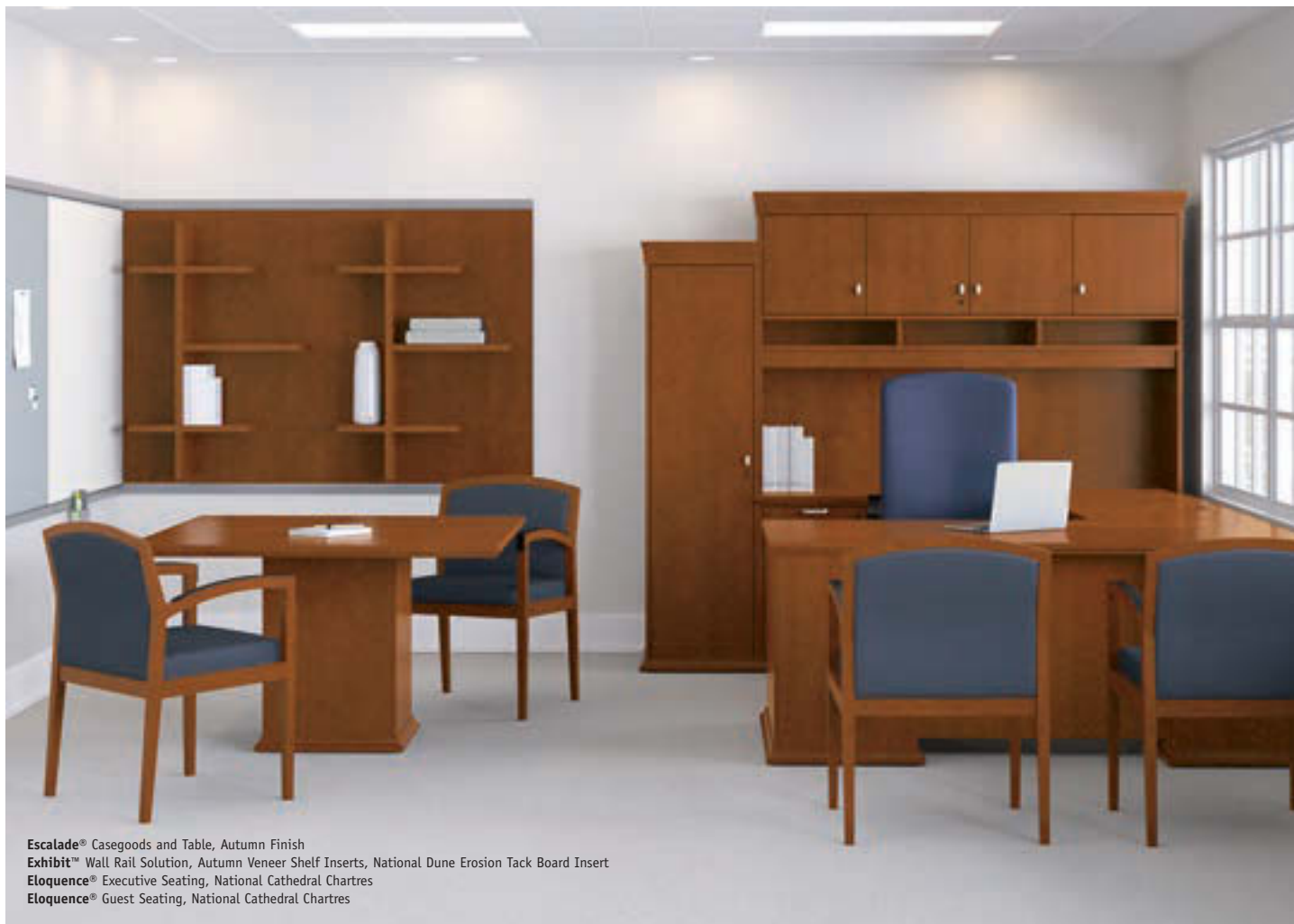
Escalade® Caseloads and Table, Autumn Finish Exhibit™ Wall Rail Solution, Autumn Veneer Shelf Inserts, National Dune Erosion Tack Board Insert Eloquence® Executive Seating, National Cathedral Chartres Eloquence® Guest Seating, National Cathedral Chartres