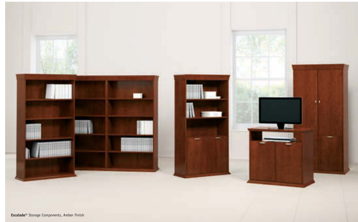
Escalade® Storage Components, Amber Finish