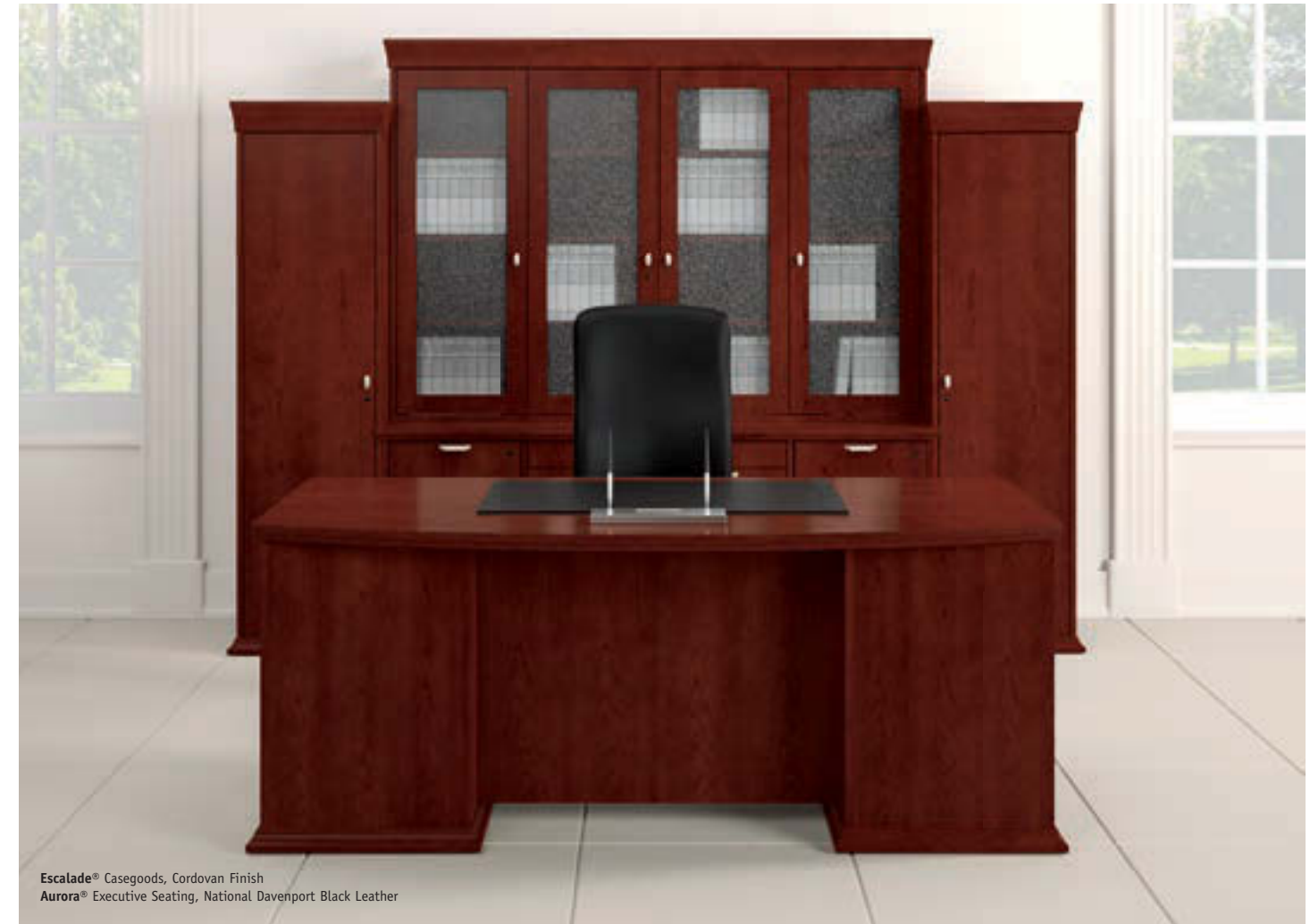
Escalade® Caseloads, Cordovan Finish Aurora® Executive Seating, National Davenport Black Leather

When the magnitude of your success calls for a larger solution, Escalade gives you grand choices. Get the luxury of bountiful storage with multiple options. Precisely scaled heights create a uniquely stepped profile, splendidly portrayed in rich hardwood veneer. Escalade does more than attest to your influence; it makes a statement that enhances the perception of your entire organization.