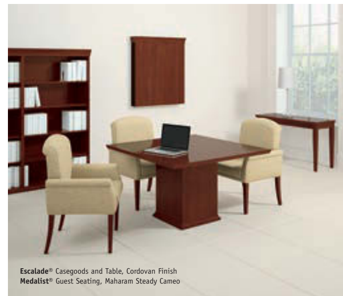
Escalade® Caseloads and Table, Cordovan Finish Medalist® Guest Seating, Maharam Steady Cameo