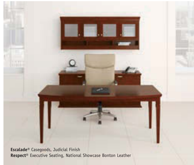
Escalade® Caseloads, Judicial Finish Respect® Executive Seating, National Showcase Bonton Leather