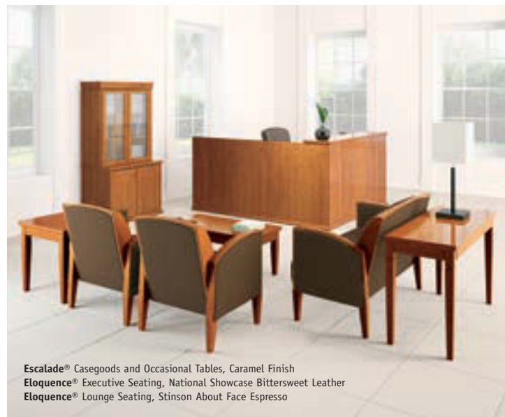
Escalade® Caseloads and Occasional Tables, Caramel Finish Eloquence® Executive Seating, National Showcase Bittersweet Leather Eloquence® Lounge Seating, Stinson About Face Espresso

From reception areas to conference rooms as well as other common areas, people still enjoy and need that face-to-face connection. Escalade brings a welcoming touch to guests, clients and employees with sustainable attributes that you can't see and stunning features that you can. Functional with today's power conveniences and productive for your organization, you can trust the quality and durability of Escalade to deliver exceptional performance to make your day a little easier.