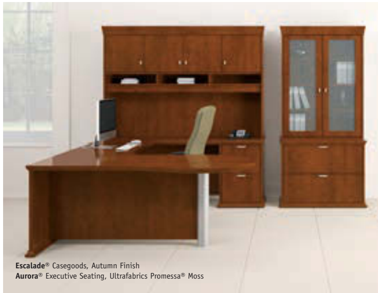
Escalade® Caseloads, Autumn Finish Aurora® Executive Seating, Ultrafabrics Promessa® Moss