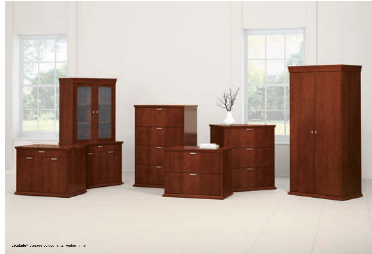
Escalade® Storage Components, Amber Finish