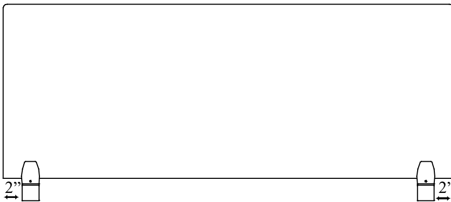
Figure B: Determine Bracket Location.