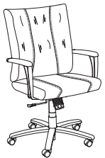
Leather & Vinyls