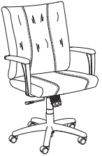
Leathers and Vinyls